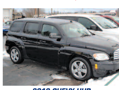
2010 CHEVY HHR Seats 5 plus lots of cargo room. AS LOW AS $199/MO.