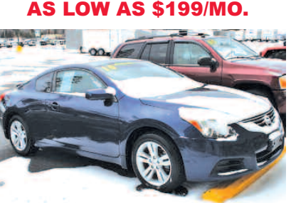
2010 NISSAN ALTIMA 39 MPG. 2 door, very sharp, 105 K. AS LOW AS $199/MO.