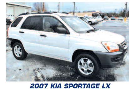
Traction control. Super Value SUV with good gas mileage. AS LOW AS $179/MO.