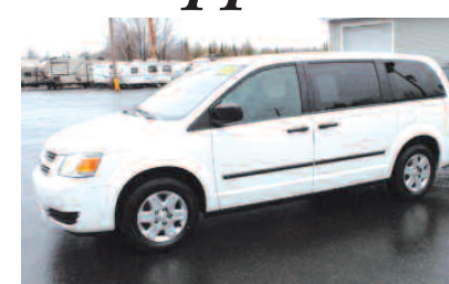
2008 DODGE GRAND CARAVAN SE. Stow-N-Go, seats 7. AS LOW AS $199/MO.