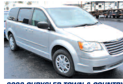
2008 CHRYSLER TOWN & COUNTRY Stow-N-Go seats, 4 captain chairs, seats 7, only 94 K.