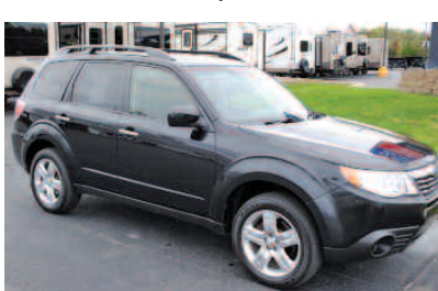
2010 SUBARU FORESTER AWD, extra large moonroof. Great car for winter. AS LOW AS $219/MO.