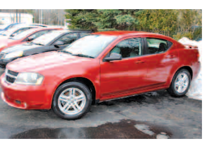
2010 DODGE AVENGER Sharp car. AS LOW AS $199/MO.