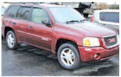
2005 GMC ENVOY 4x4, tow pkg. AS LOW AS $189/MO.