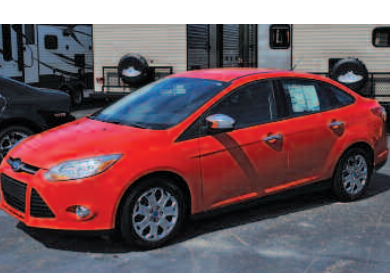
2012 FORD FOCUS SE Only 84 K, 4 cyl, 38 MPG. AS LOW AS $179/MO.